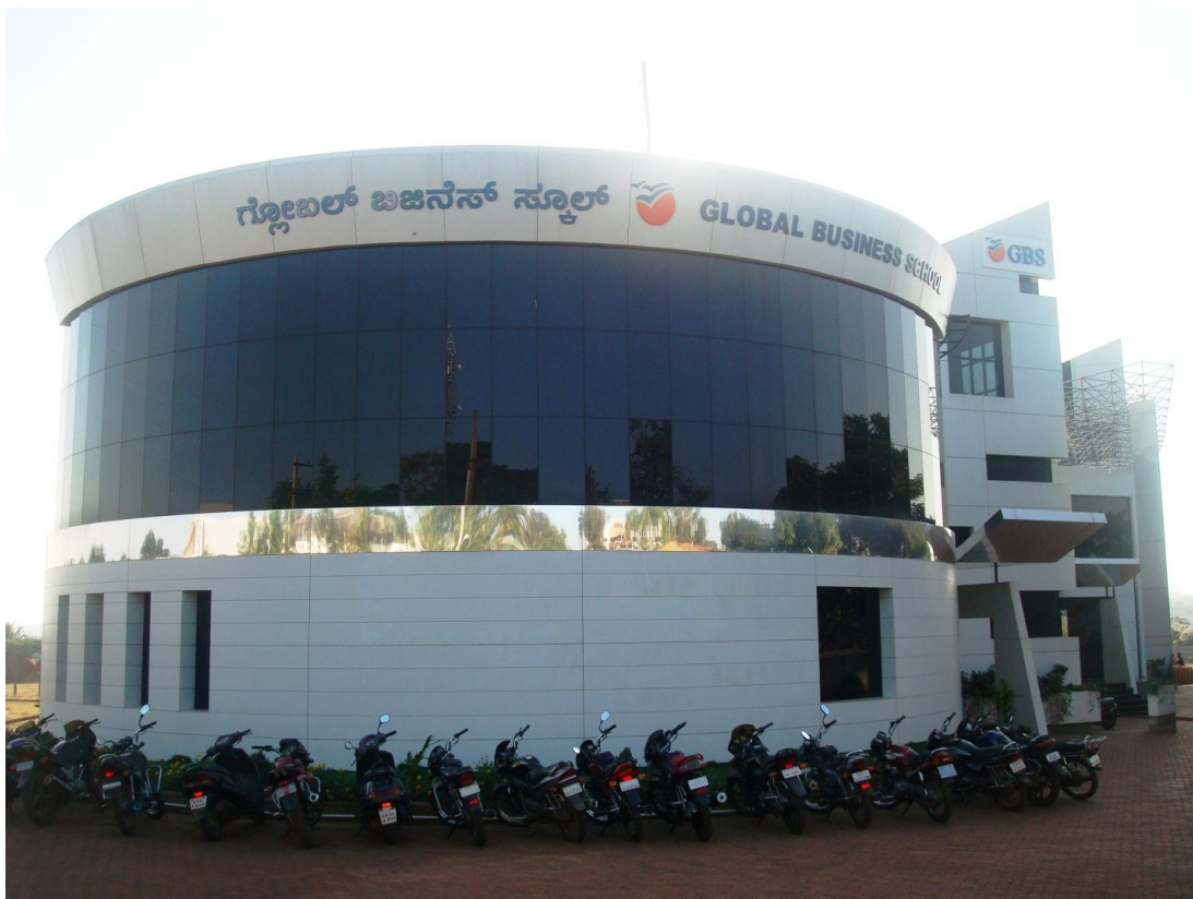
The façade has orbs and projections, layer and curves and combines contrasts like opacity and transparency, subtlety and drama.